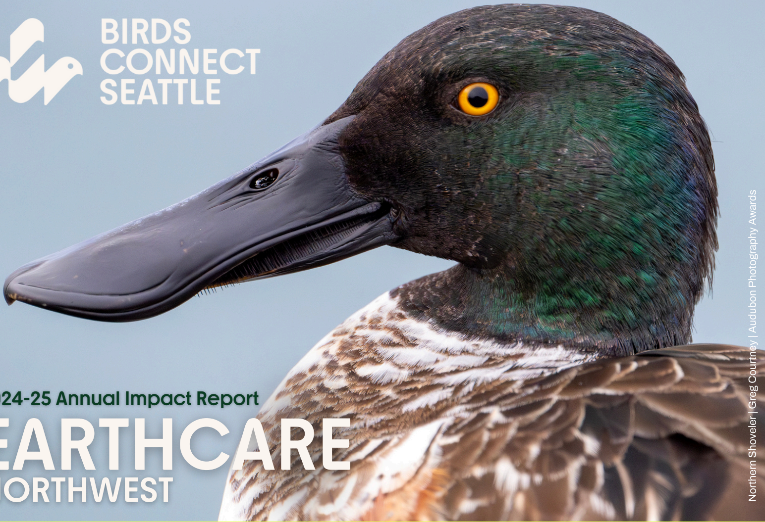
Northern Shoveler