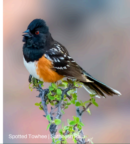
Spotted Towhee | Satheesh Rajh