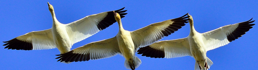
Snow Geese