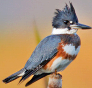
Belted Kingfisher