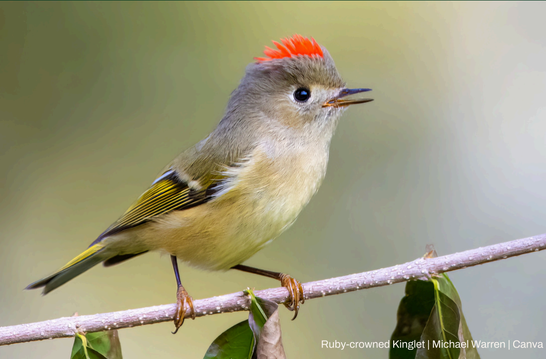
Ruby-crowned Kinglet